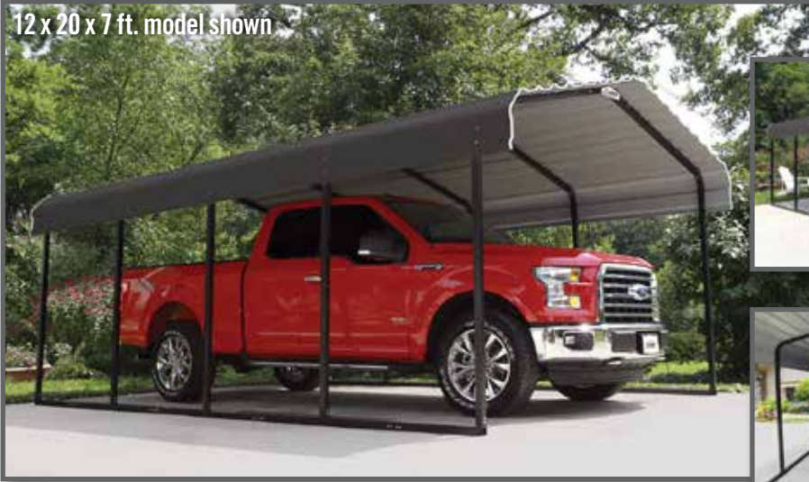
12 x 20 x 7 ft. model shown

Multi-use shelter and carport – perfect for vehicles, boats, tractors, and outdoor picnic areas and patio furniture.