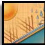
UV treated fabric