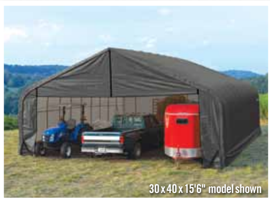
30 x 40 x 15'6" model shown